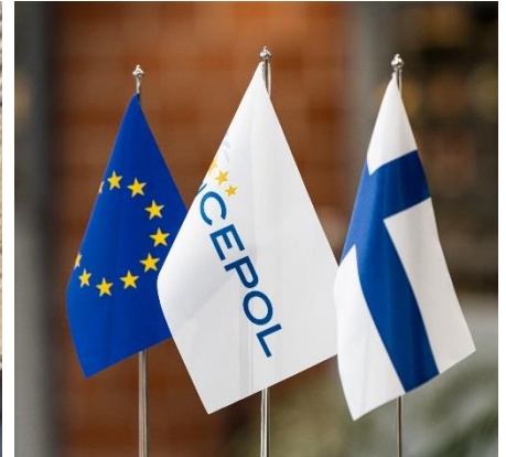
CEPOL Future Leaders Module 2 was held in Tampere in 2022. CEPOL Leadership course was granted to Polamk in 2023.