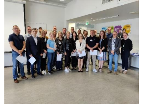
Participants of the Staff Event in June 2022.

Police University College organised an international staff mobility event in 14 th -16 th of June 2022. The event consisted of lectures, workshops and presentations. Event gathered 24 participants from nine different European countries. First day was orientation day, which culminated in relaxing evening programme with sauna, swimming and good food. In the second day of the event, the staff of Polamk showed their expertise and facilities in short, but interesting presentations. Second day was finalized with walking tour in the city centre of Tampere. The third and the last day of the event was workshop day. Participants took part in two workshops with separate themes. Workshops were a great way to learn from each other at the end of the event, so no one left home empty handed. The grand finale of the event consisted cake, coffee, certificates and good byes.