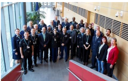
Family photo from the UNPCC course held in October.

UNPCC was held at Polamk in October. The course is a UN high-level flagship course for police leaders. The course lasted for 2 weeks (17.-28.10) and was organized by the UN Integrated Training Services together with CMC Finland and Polamk. Polamk offered the premises for the course as well as help with the practical matters related to running the course. The course provided students with core competencies, skills and necessary knowledge regarding leadership in UN police components field operations to high-level police officers. The course had 16 participants from 12 different countries, including Finland.