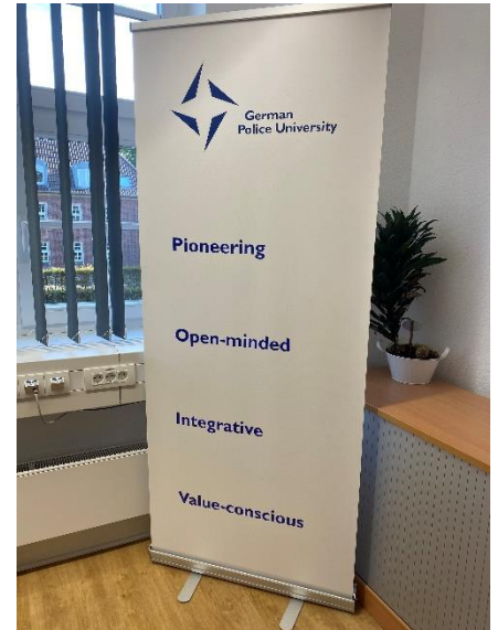
At a meeting room at DHPol.