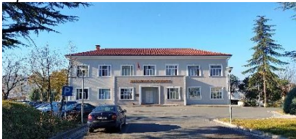
Headquarters of Security Academy in Tirana. Project office located on the upper right corner of the HQ.

More information about the project can be found on project website https://scesa.al/ . This Twinning project is funded by the European Union.