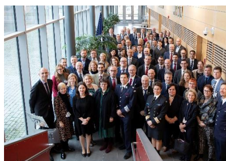
Photo of the keynote speakers and CSDP High Level course participants on the first day of the course.

The High Level course consists of 4 modules. Module 3 will take place in Roskilde, Denmark in April 2023 and module 4 in Vienna, Austria in June 2023.